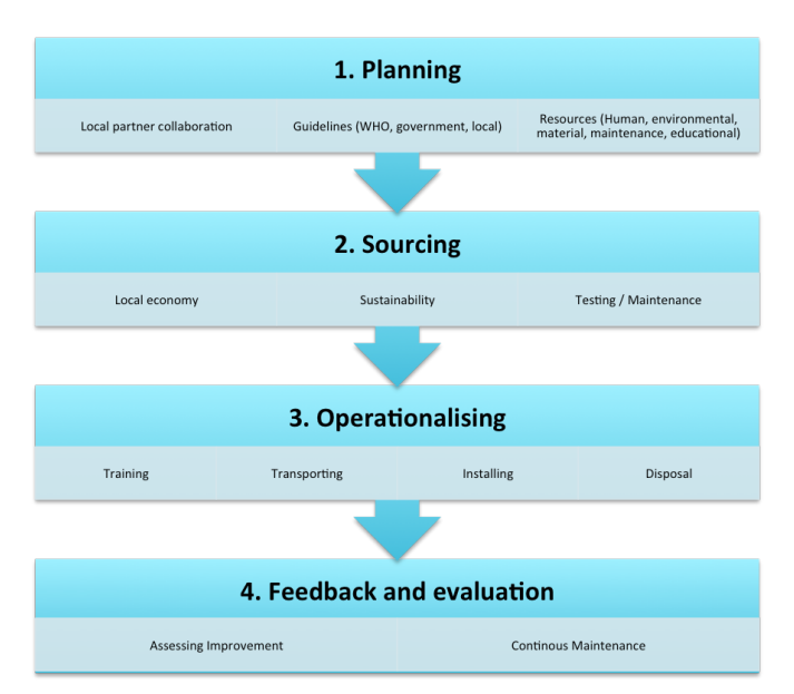
Figure 1 Demonstrates visually the steps required in planning a medical equipment donation project.

Aside from national policy documents, there are multiple ways to ascertain the most suitable equipment for donation. Adherence to the WHO principles of good donation is recommended, ensuring maximum benefit for the recipient and respecting their wishes and context (see box 1). Guidelines encourage recipient hospitals to create lists of their prioritised equipment needs, including model specifications, spare parts and